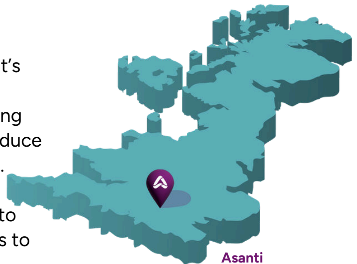
Asanti Reading Data Centre

We are Asanti, and we are purpose built to deliver leading edge data centre solutions to the businesses of today, and tomorrow.