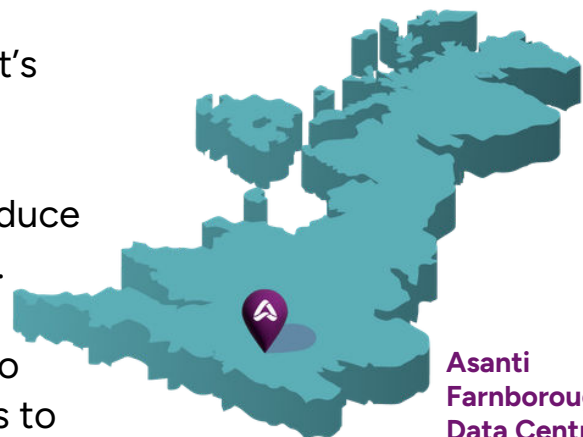
Asanti Farnborough Data Centre

We are Asanti, and we are purpose built to deliver leading edge data centre solutions to the businesses of today, and tomorrow.