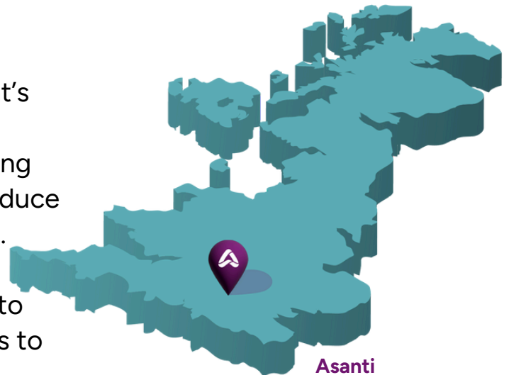
Asanti Reading Data Centre

We are Asanti, and we are purpose built to deliver leading edge data centre solutions to the businesses of today, and tomorrow.