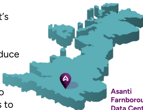
Asanti Farnborough Data Centre

We are Asanti, and we are purpose built to deliver leading edge data centre solutions to the businesses of today, and tomorrow.