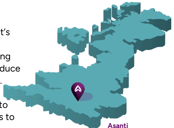
Asanti Reading Data Centre

We are Asanti, and we are purpose built to deliver leading edge data centre solutions to the businesses of today, and tomorrow.